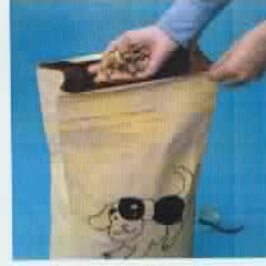
FTS-closure with tear strip